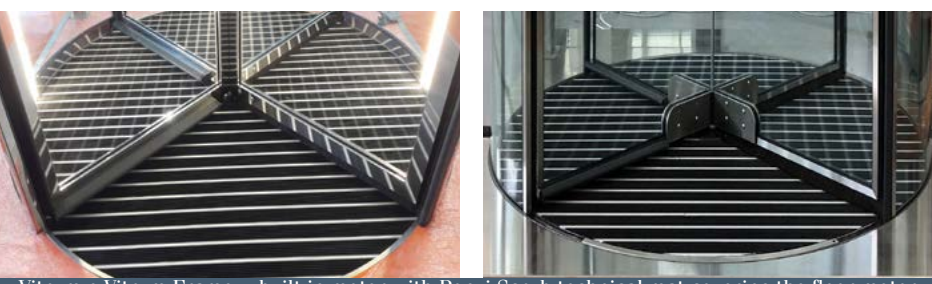
steel ring is provided to be pre-fixed. Vitrum e Vitrum Frame - built in motor with Ponzi Scrub technical mat covering the floor motor