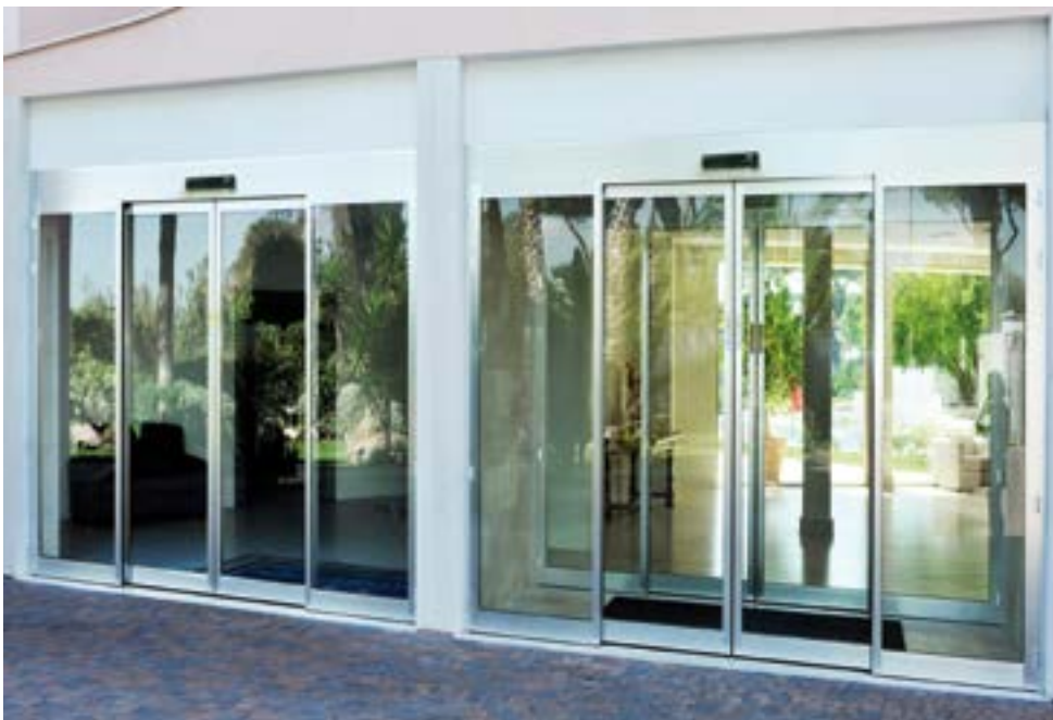
Security entrances with double automatic doors opening under interlock function - suitable access control areas