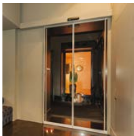
Hotel - internal filter with PONZI slim profile