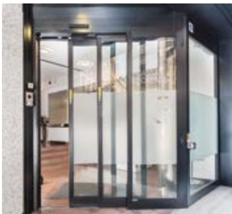
Office building - easy opening passage in a small space