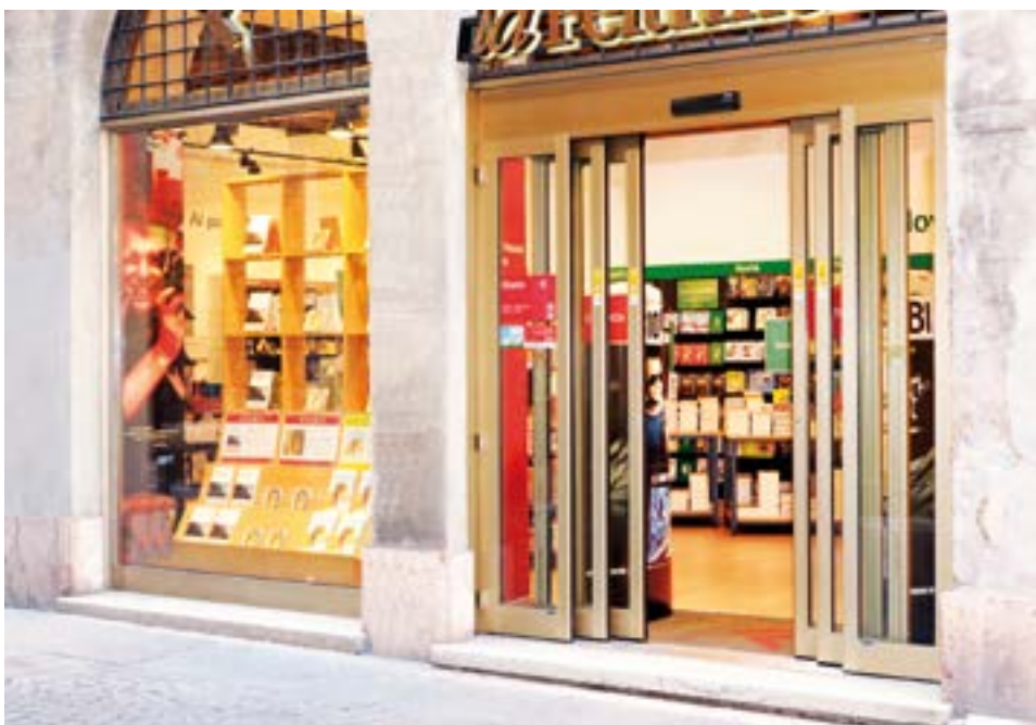
Retail shop - Bilateral Telescopic the widest entrance suitable for an easy access to all kind of customers