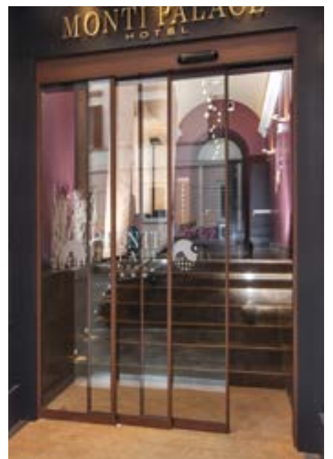
Boutique Hotel main entrance - slim profile 20 mm

— | THE OPTIMAL SOLUTION FOR WIDE PASSAGES | —