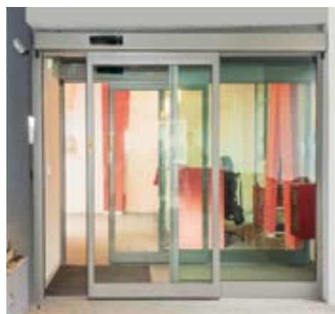
Office entrance - thermal insulation with heavy glasses