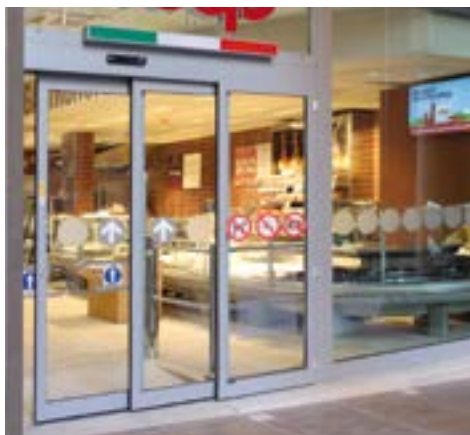
Shop entrance - easy way for transit of trolleys and carts