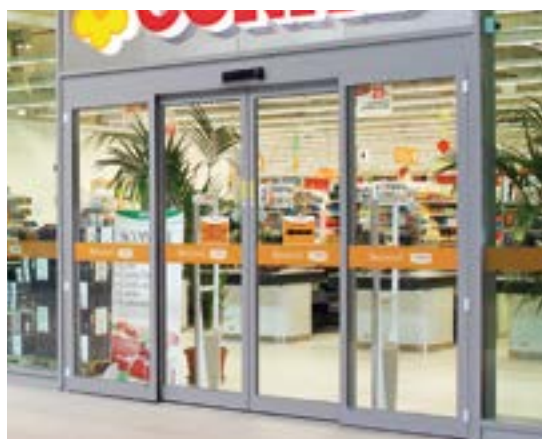
Supermarket - the best choice for an easy and continuous access