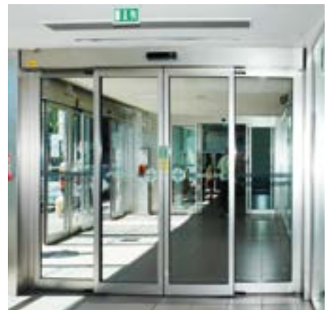
Airport entrance door - antipanic breakout doorwings