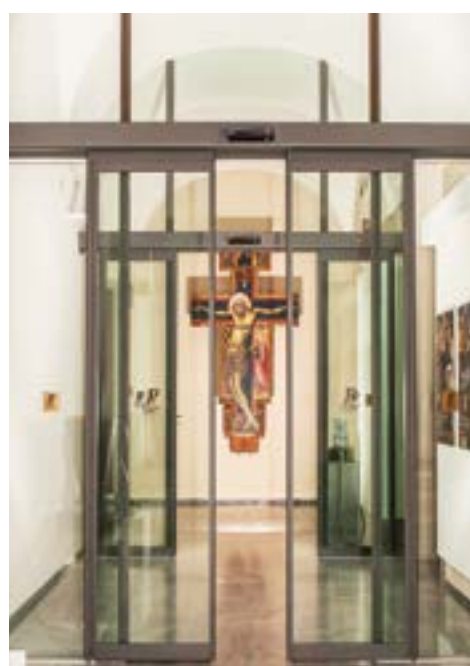
Museum - design and electronic security integration