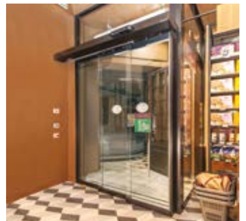
Prestigious shop in historical context - "all glazed" wings