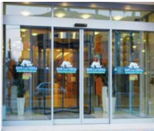
Bank main entrance sliding door for extra protection - heavy glasses