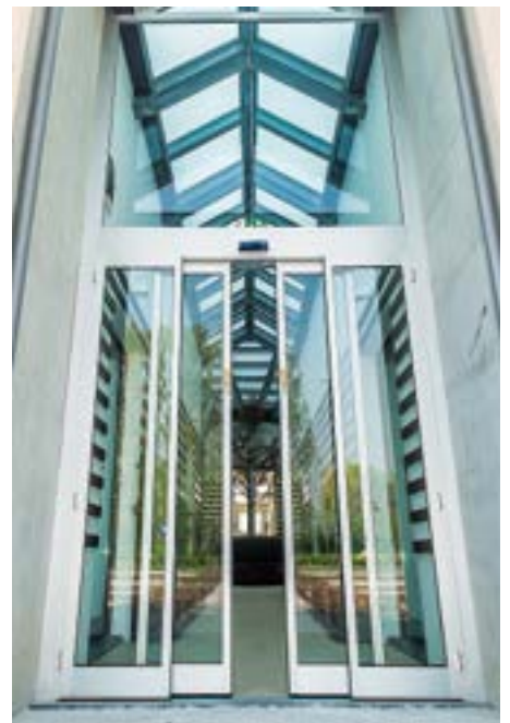
Architectural and design buildings - special high entrance