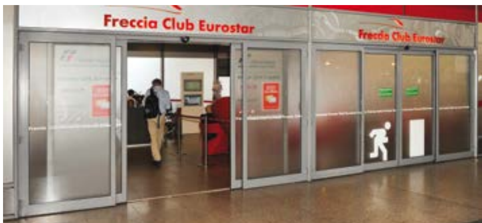
Railway Station - automatic doors solution suitable for intensive traffic and passengers controlled area