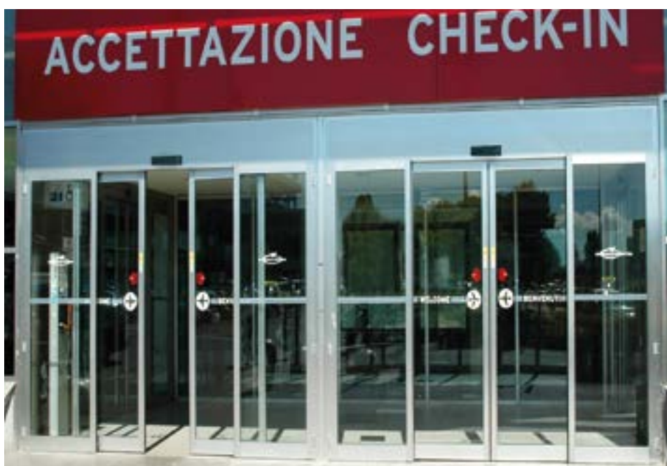
Airport main entrances - AS3 for its performant technical characteristics is suitable for heavy airport traffic flow