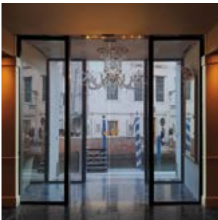
Luxury Hotel prestigious entrance - italian design