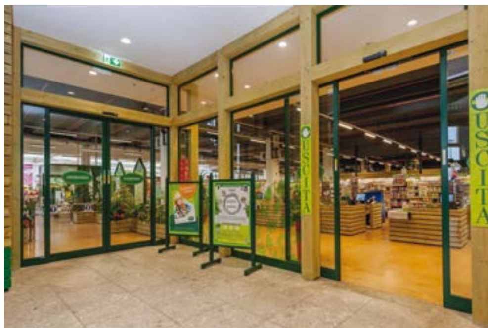
Commercial activities are requiring safe and security access - AS4 a right solution for an easy traffic flow